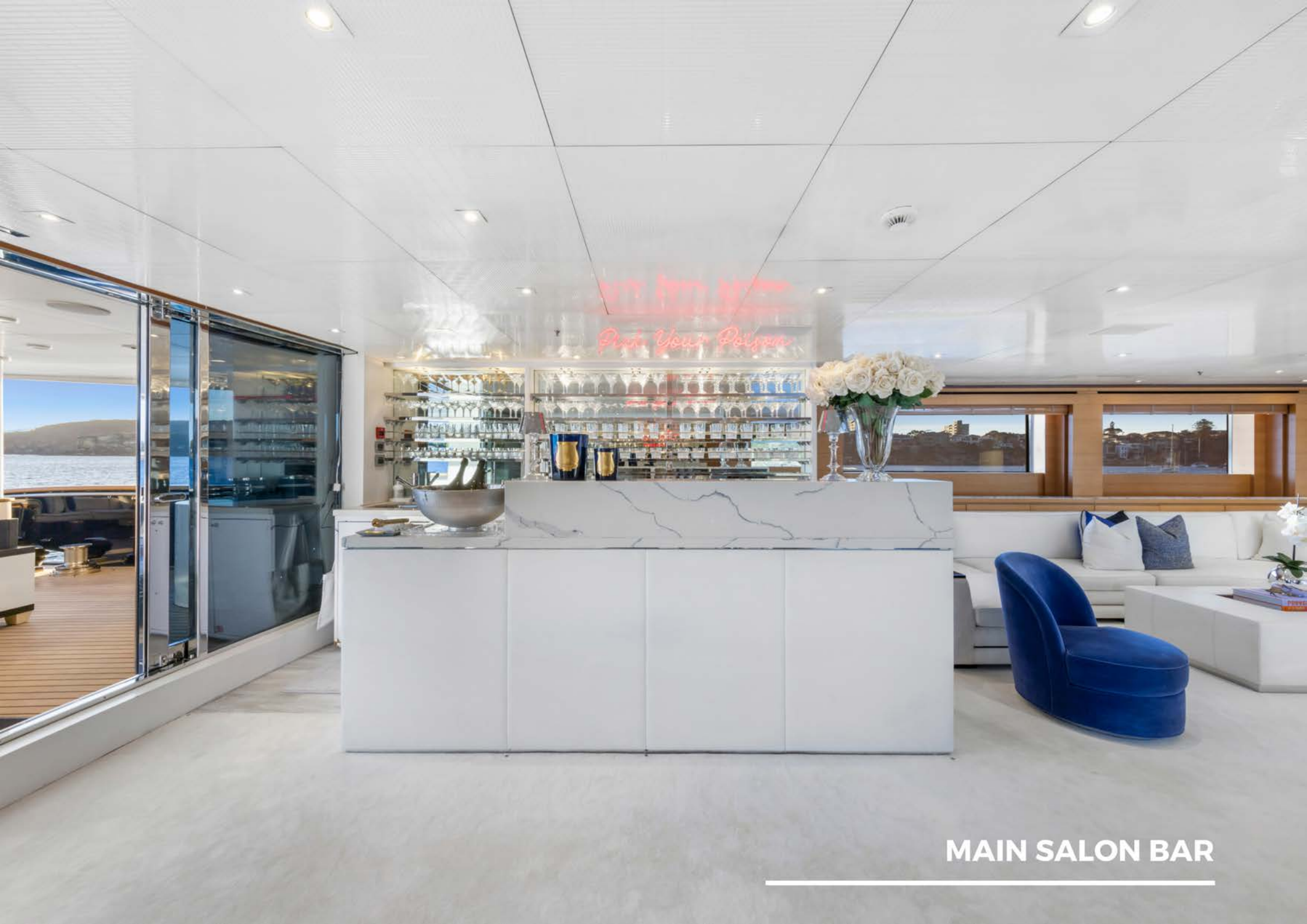
MAIN SALON BAR