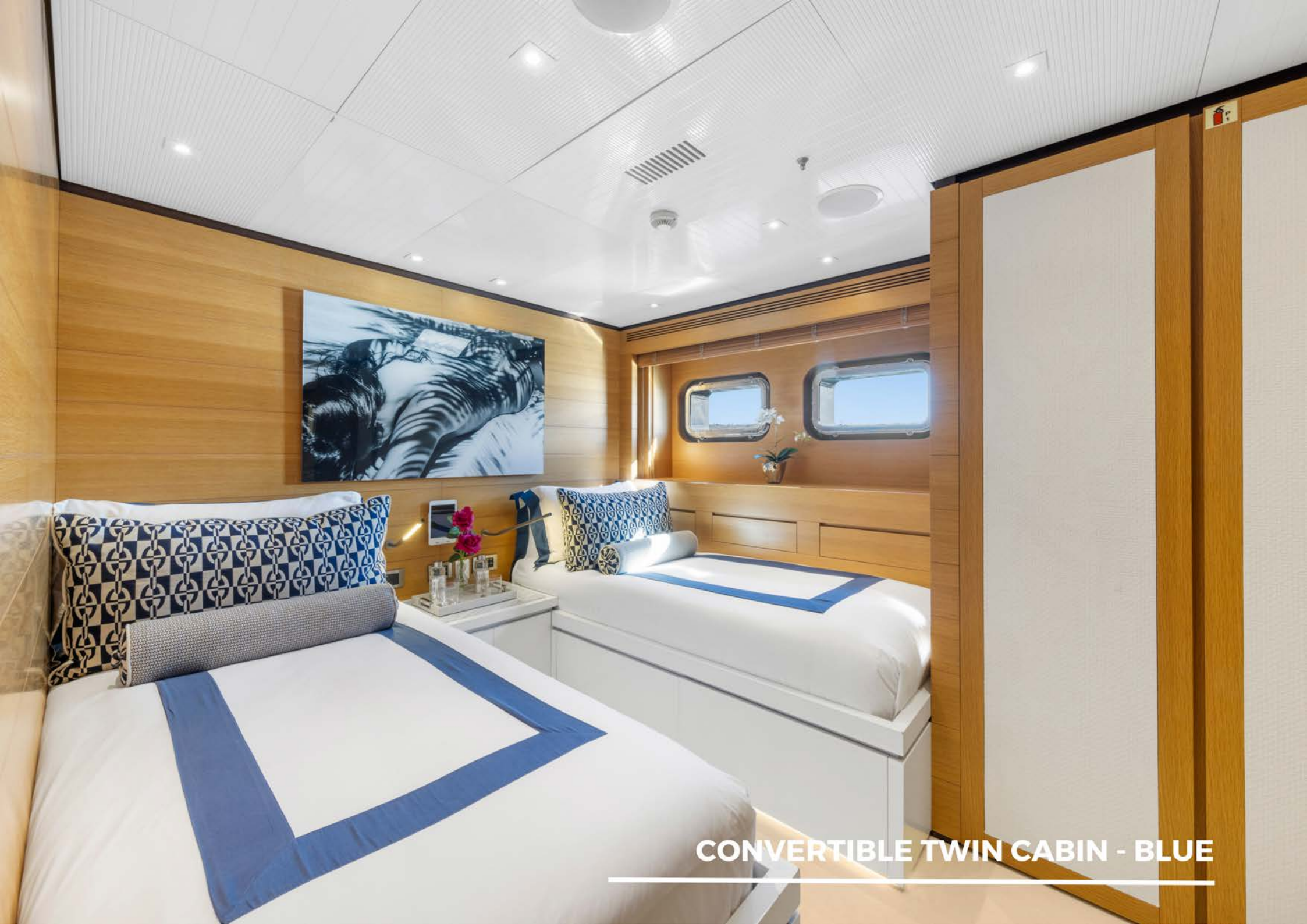
CONVERTIBLE TWIN CABIN - BLUE