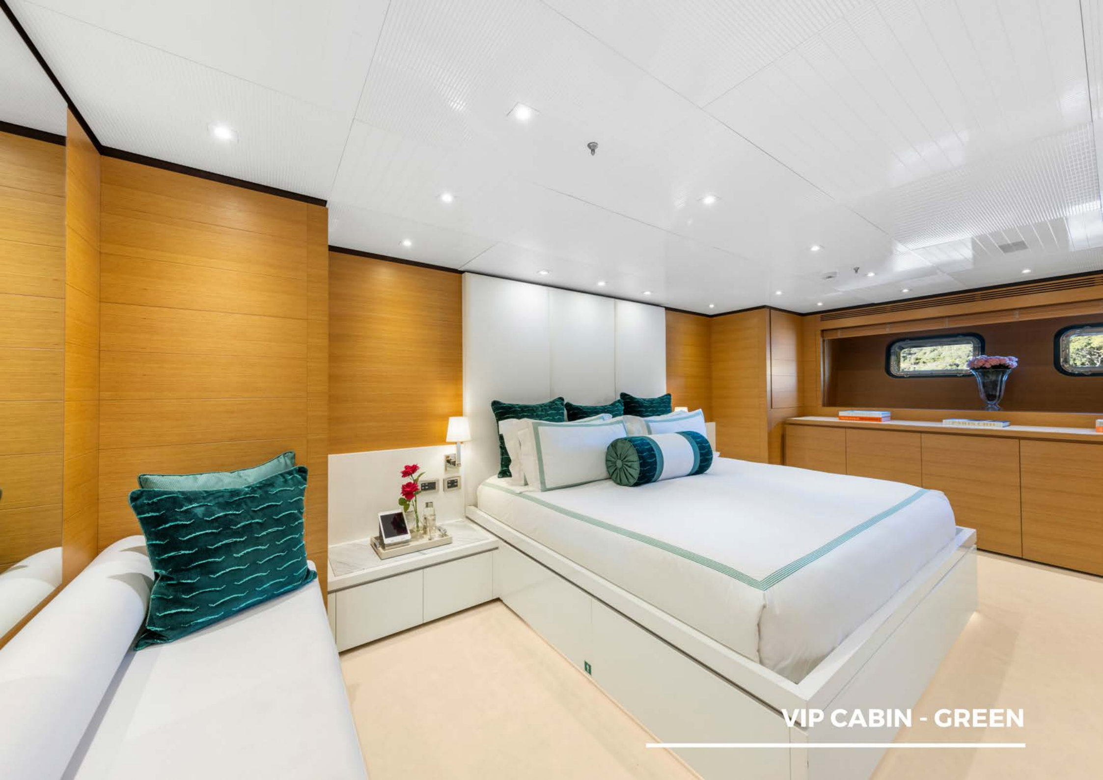
VIP CABIN - GREEN