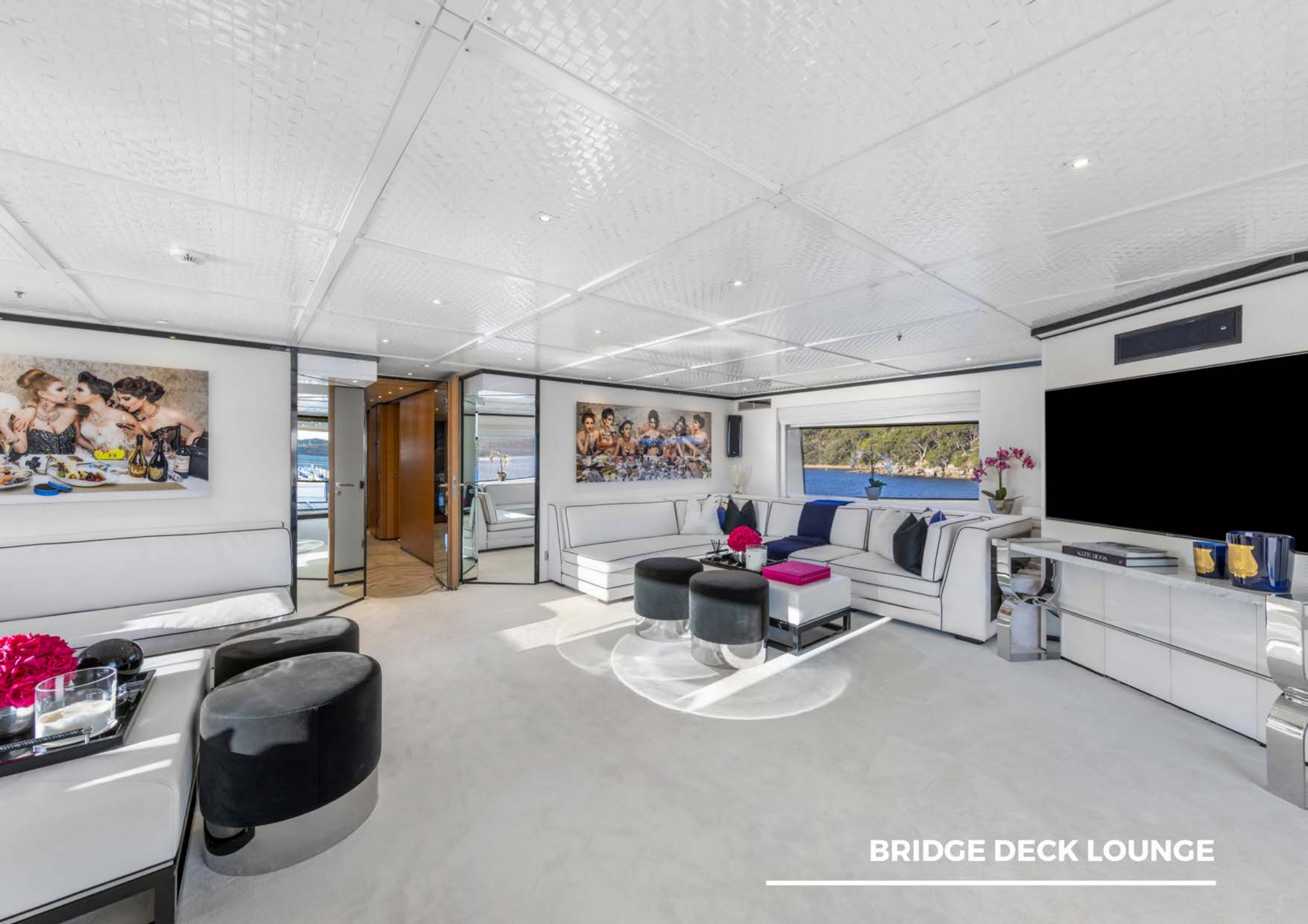
BRIDGE DECK LOUNGE