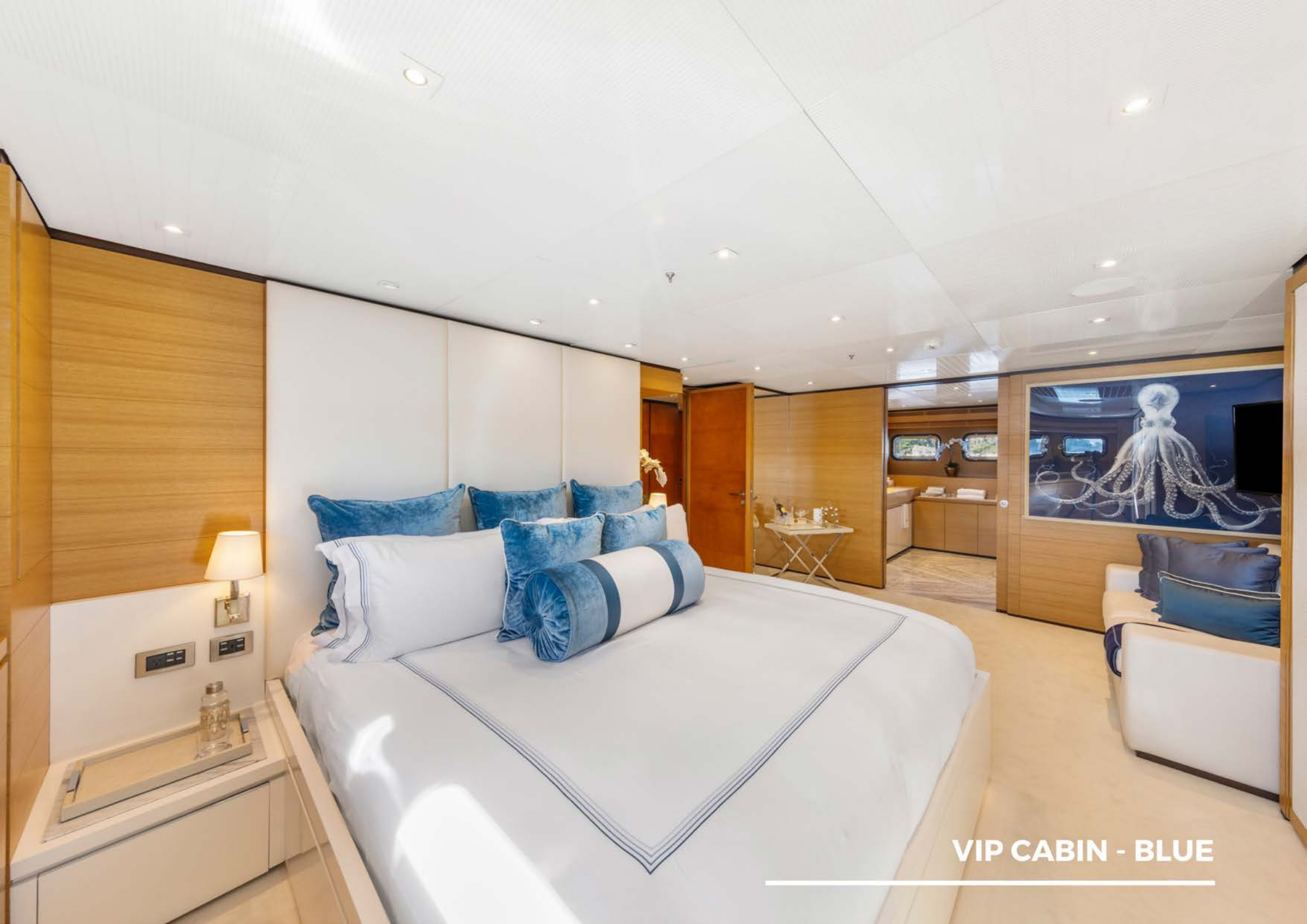
VIP CABIN - BLUE