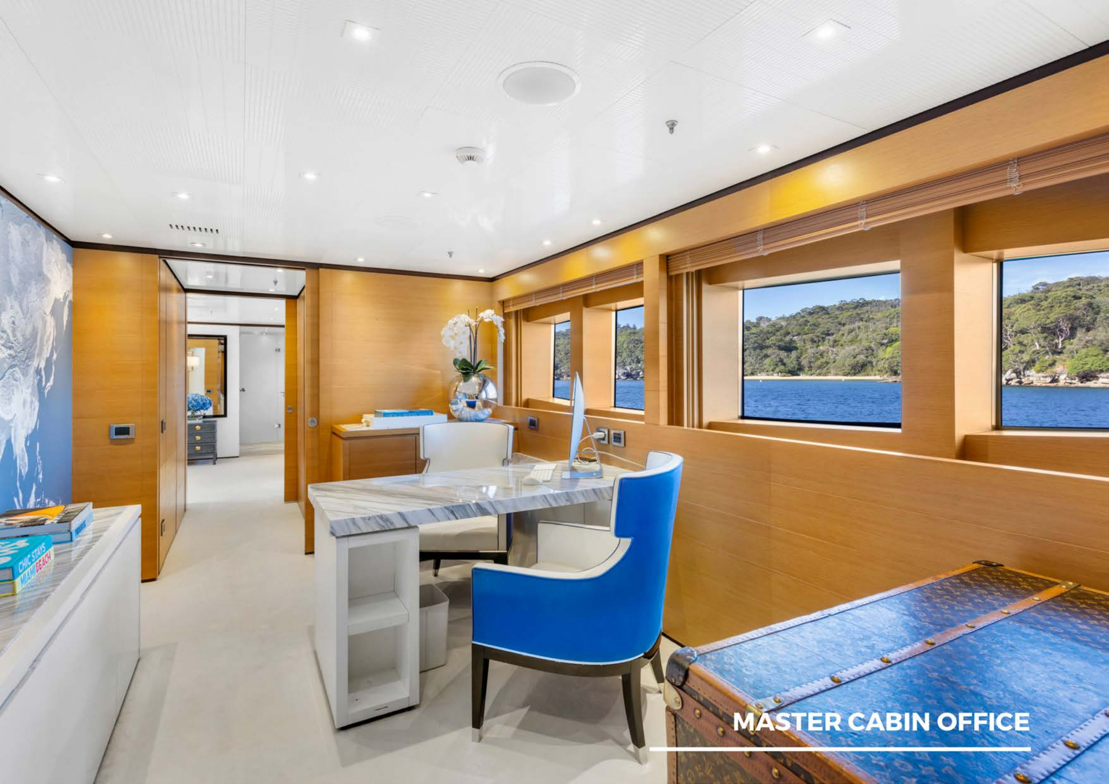
MASTER CABIN OFFICE