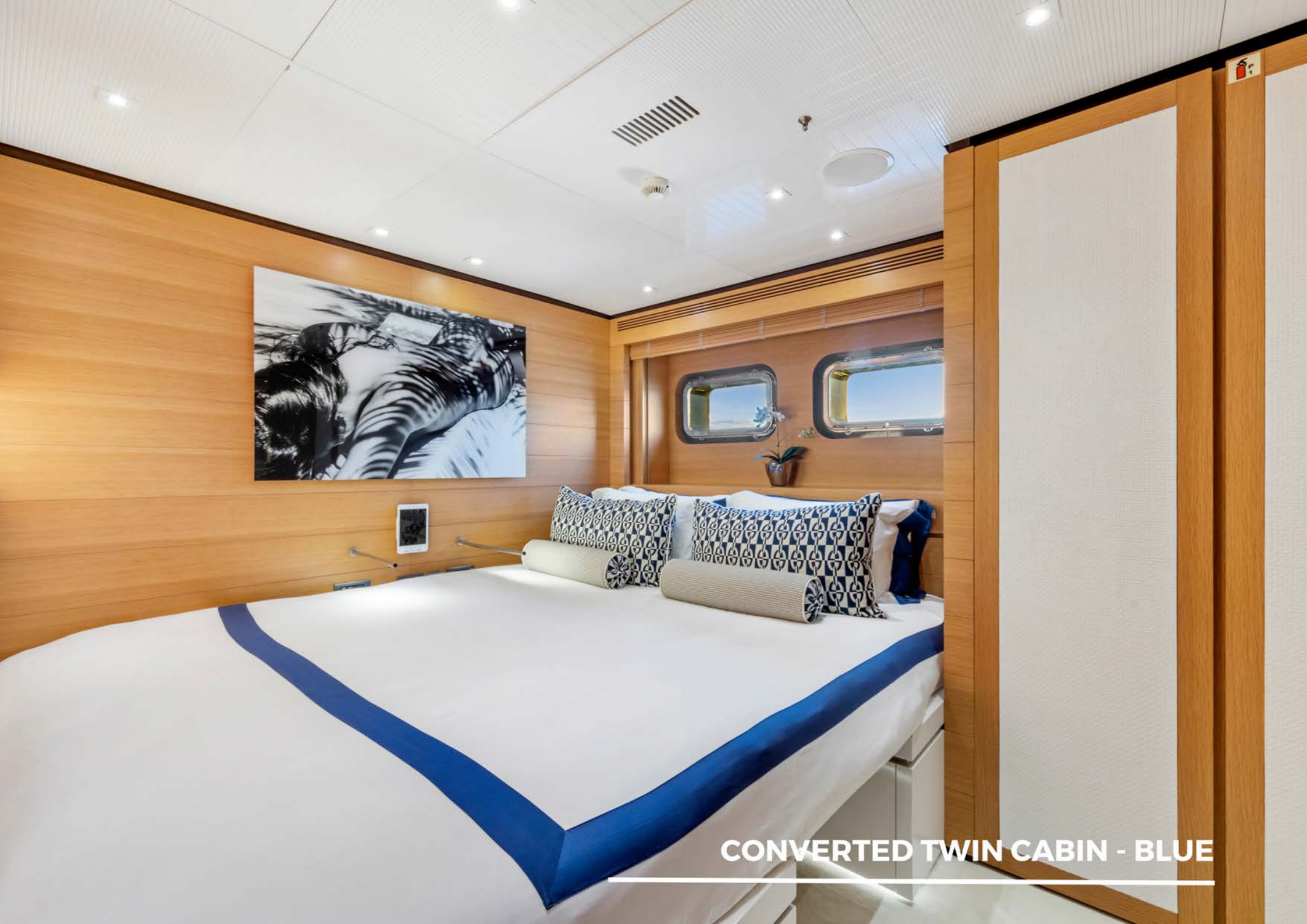
CONVERTED TWIN CABIN - BLUE