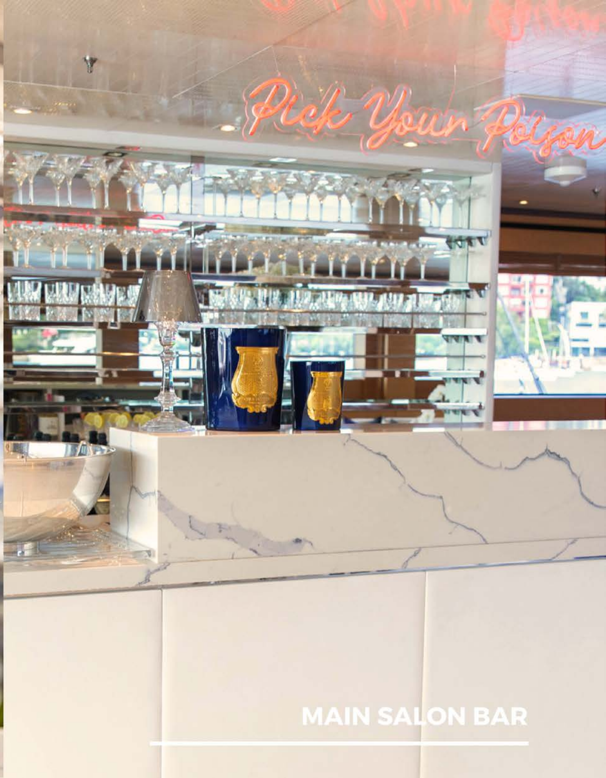
MAIN SALON BAR