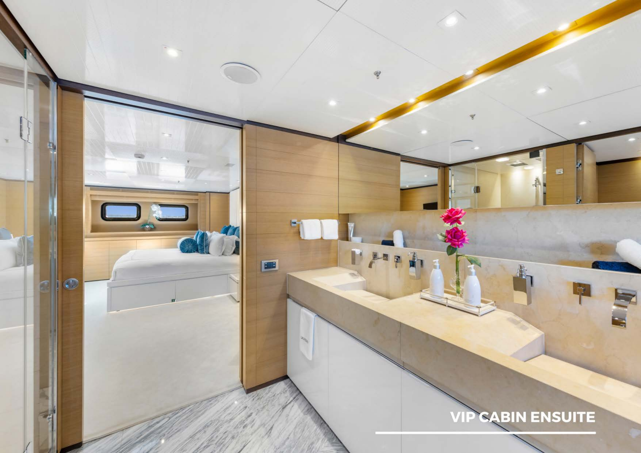
VIP CABIN ENSUITE