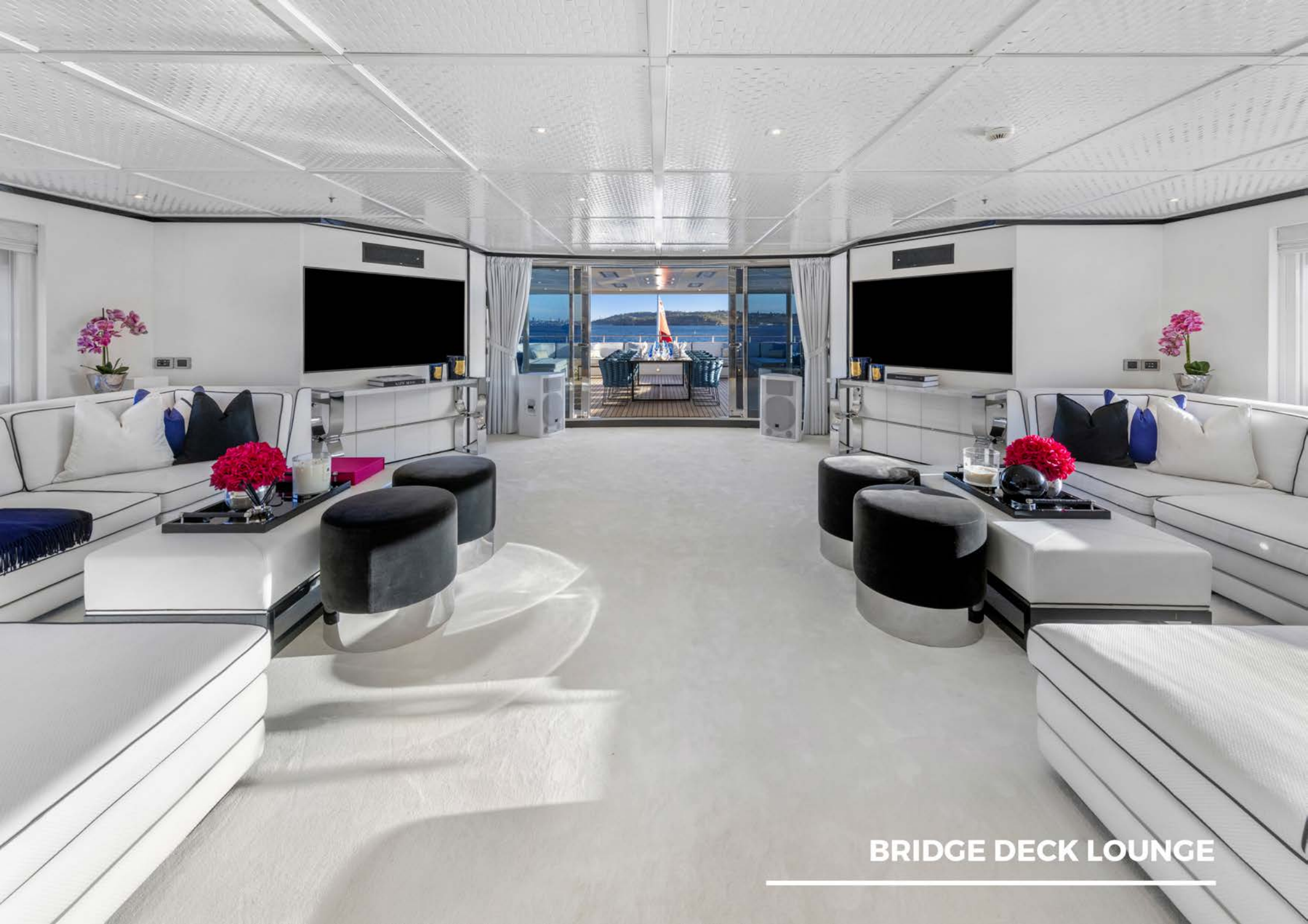
BRIDGE DECK LOUNGE