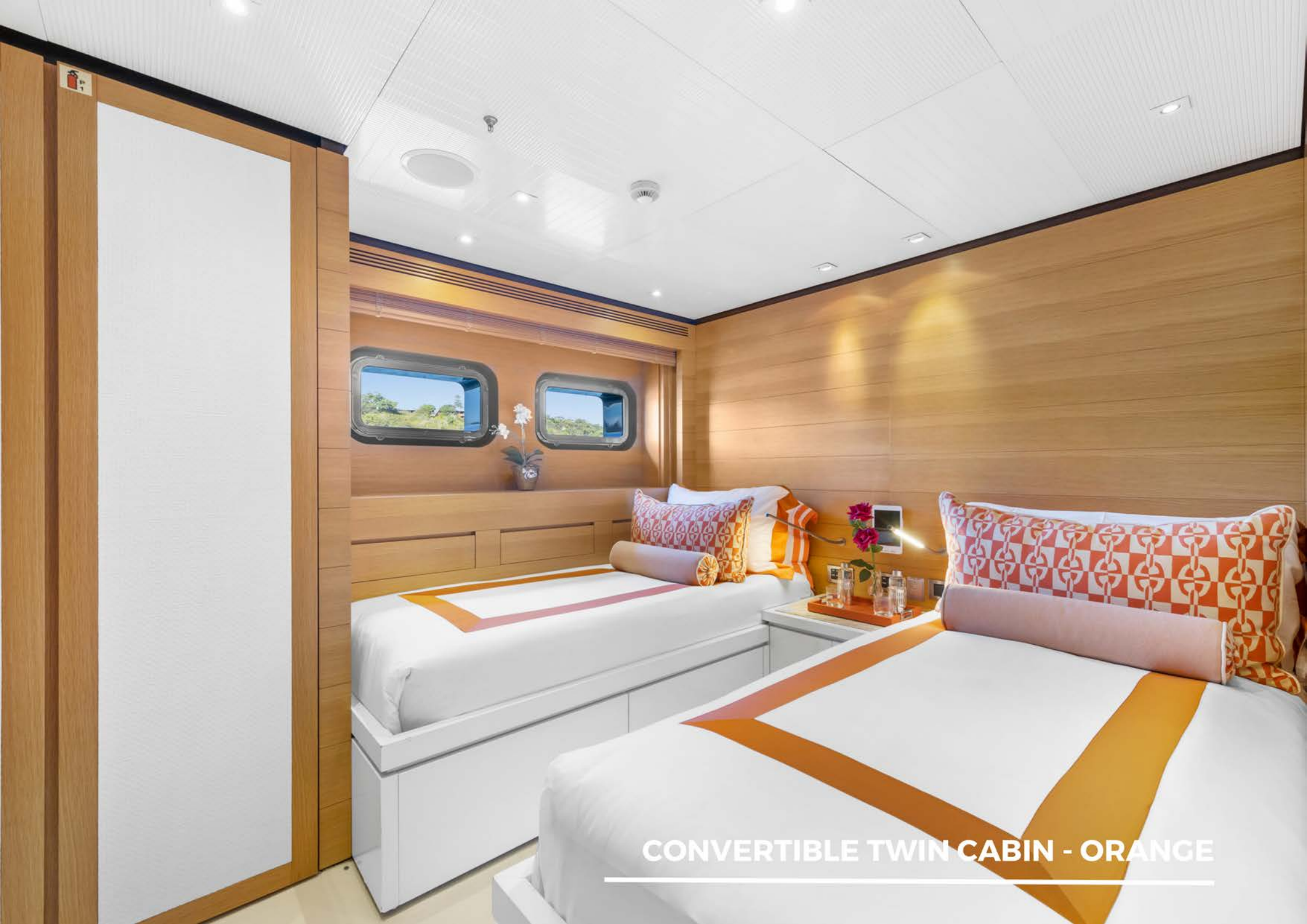
CONVERTIBLE TWIN CABIN - ORANGE