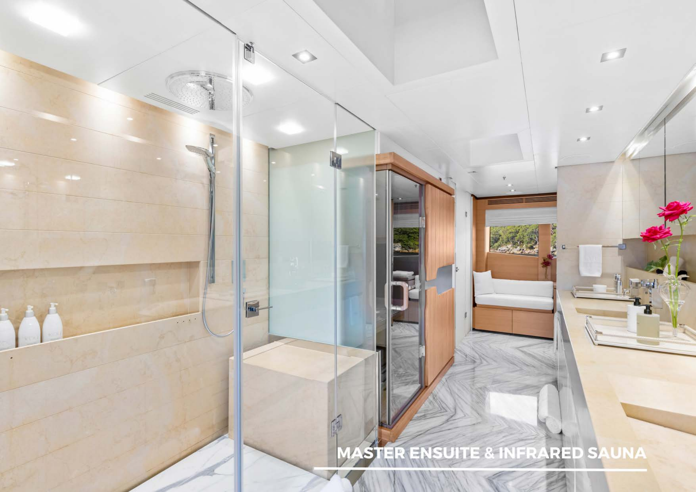
MASTER ENSUITE & INFRARED SAUNA