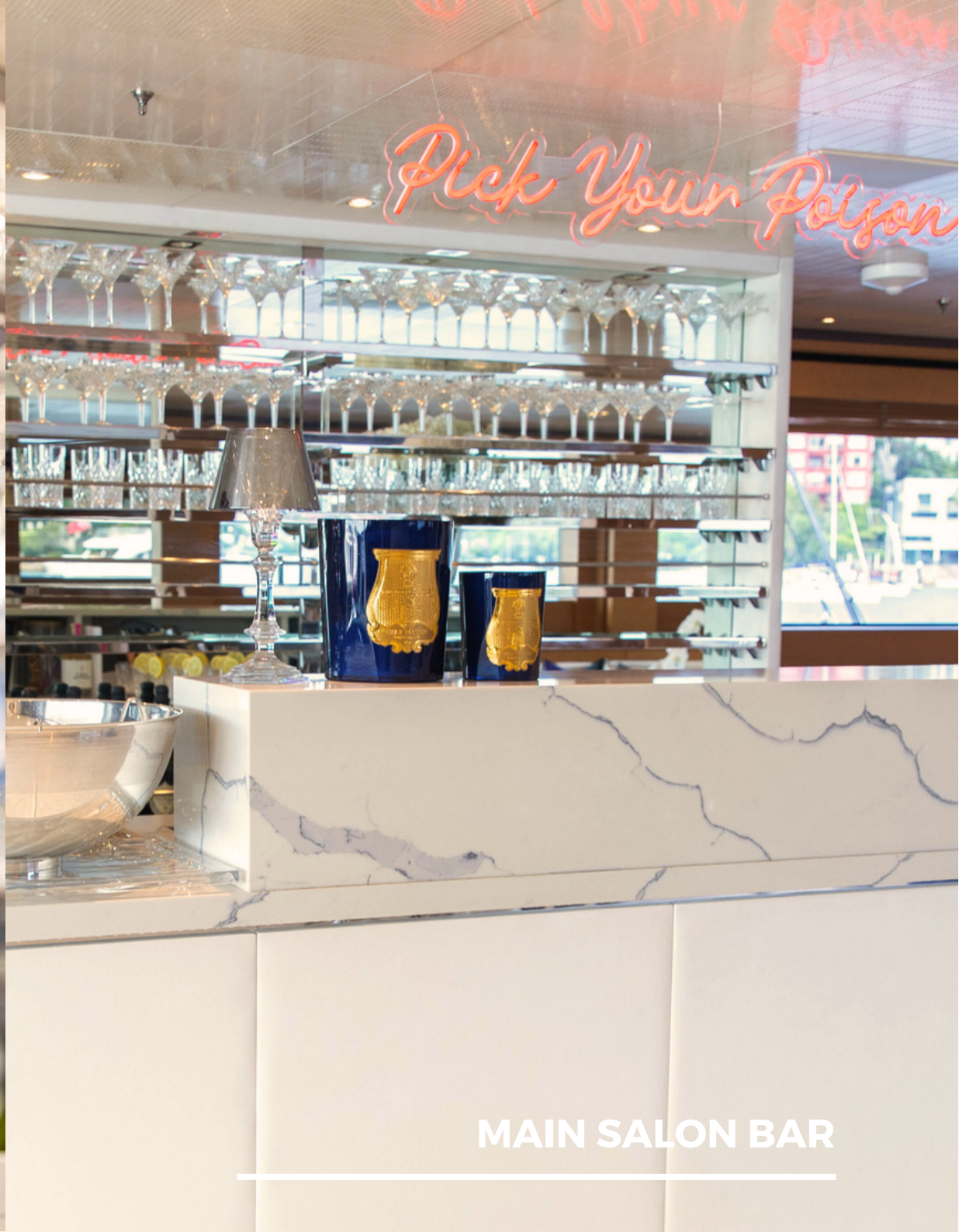
MAIN SALON BAR