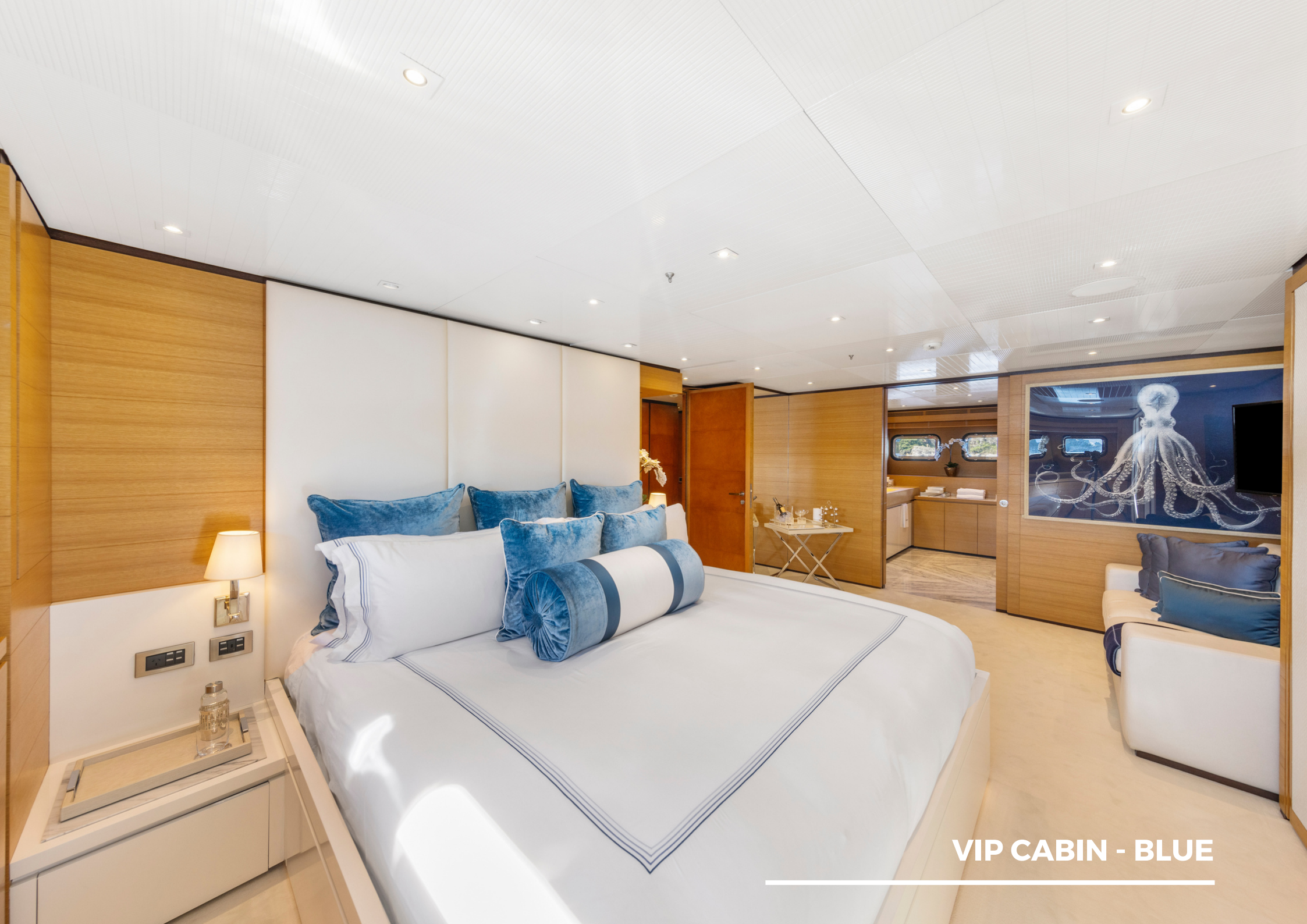
VIP CABIN - BLUE