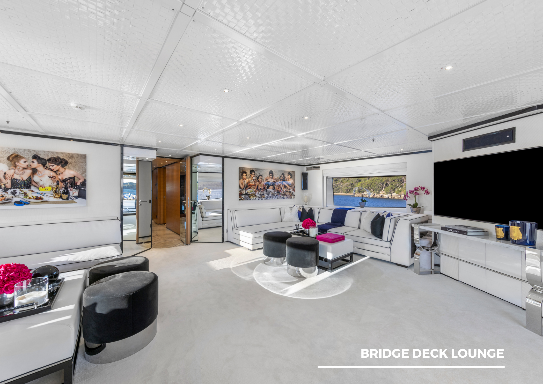
BRIDGE DECK LOUNGE