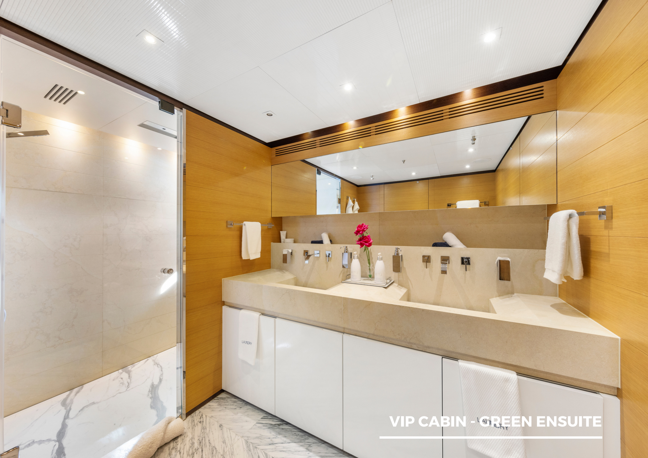
VIP CABIN - GREEN ENSUITE