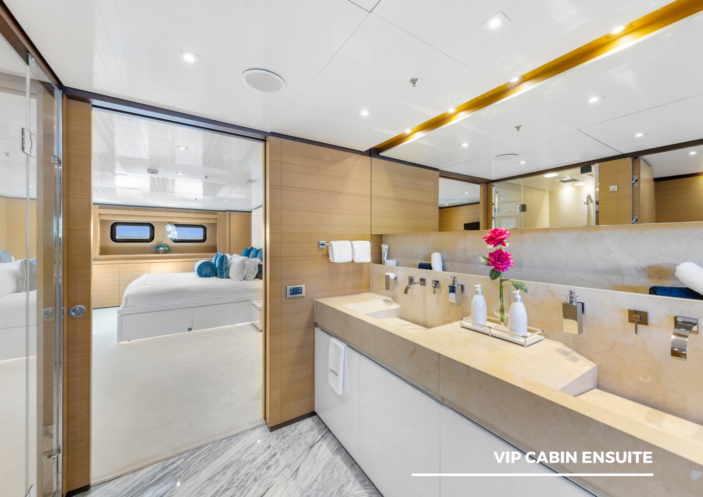
VIP CABIN ENSUITE