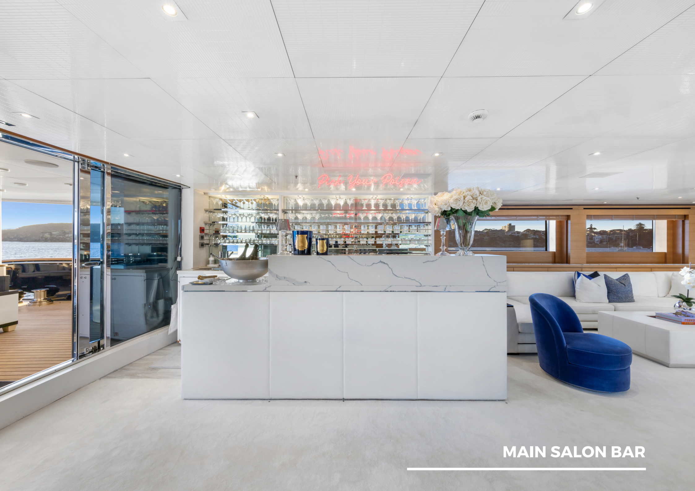
MAIN SALON BAR