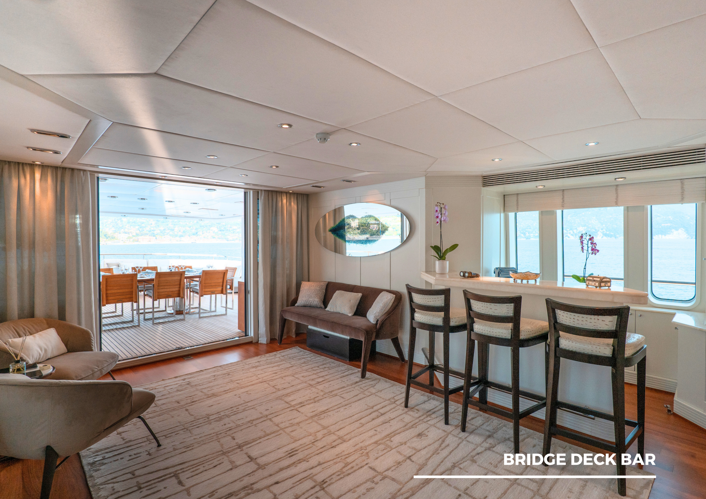
BRIDGE DECK BAR