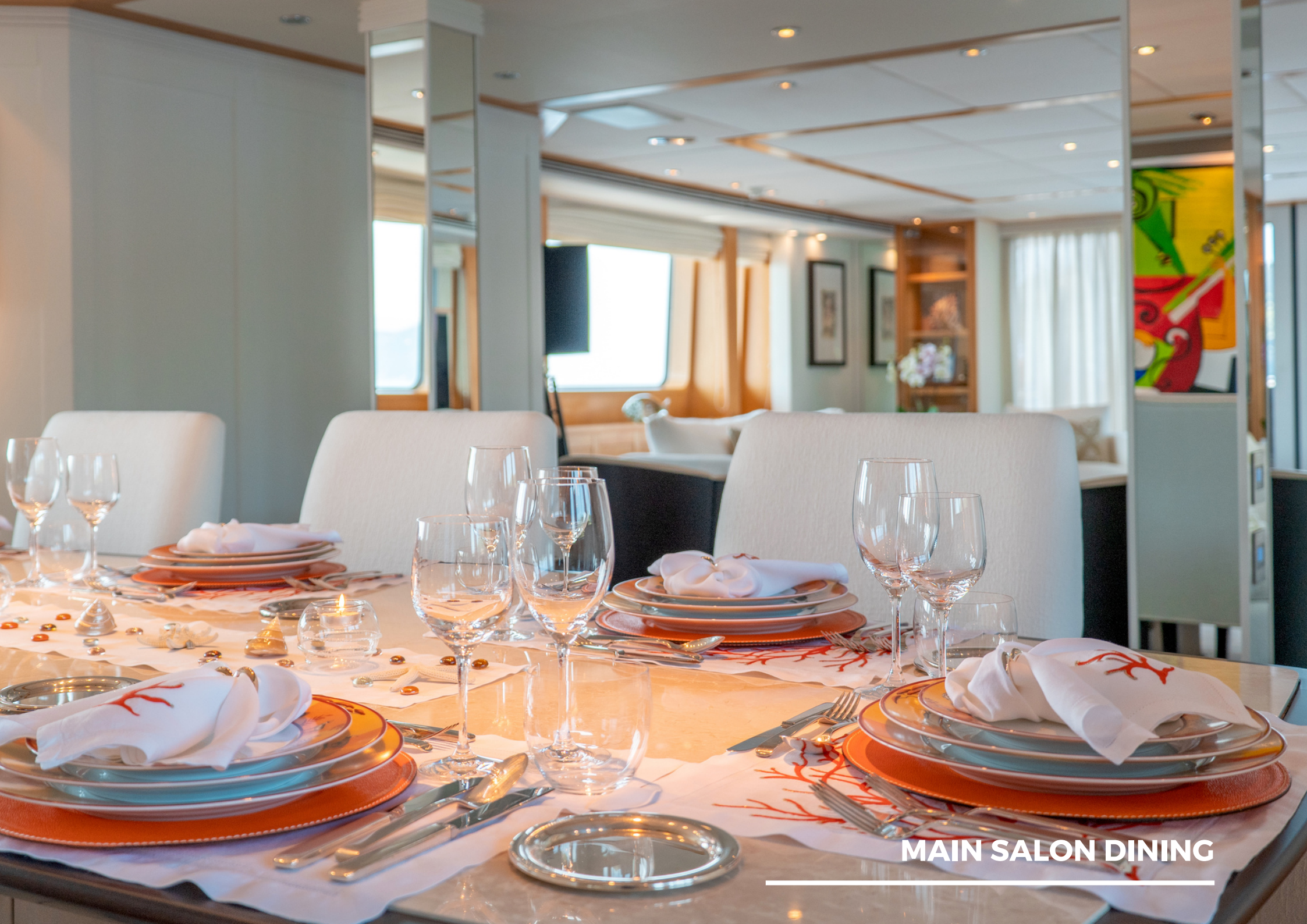
MAIN SALON DINING