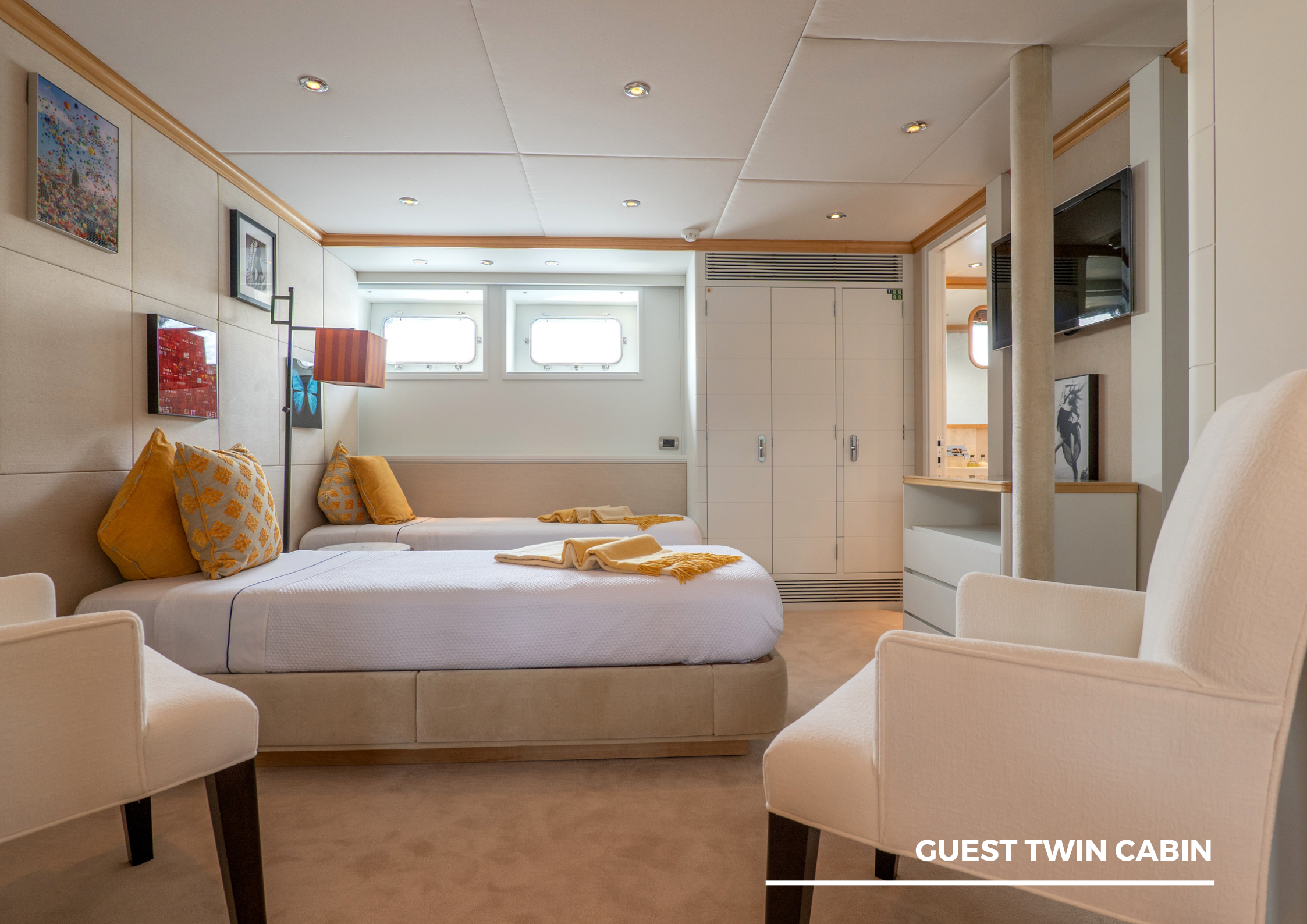
GUEST TWIN CABIN