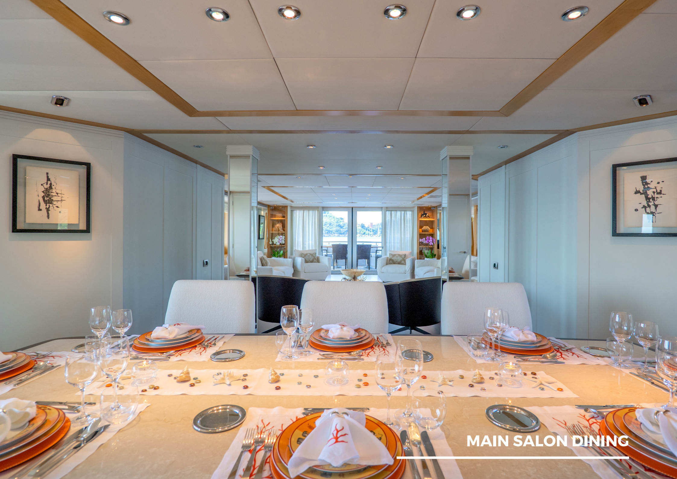
MAIN SALON DINING