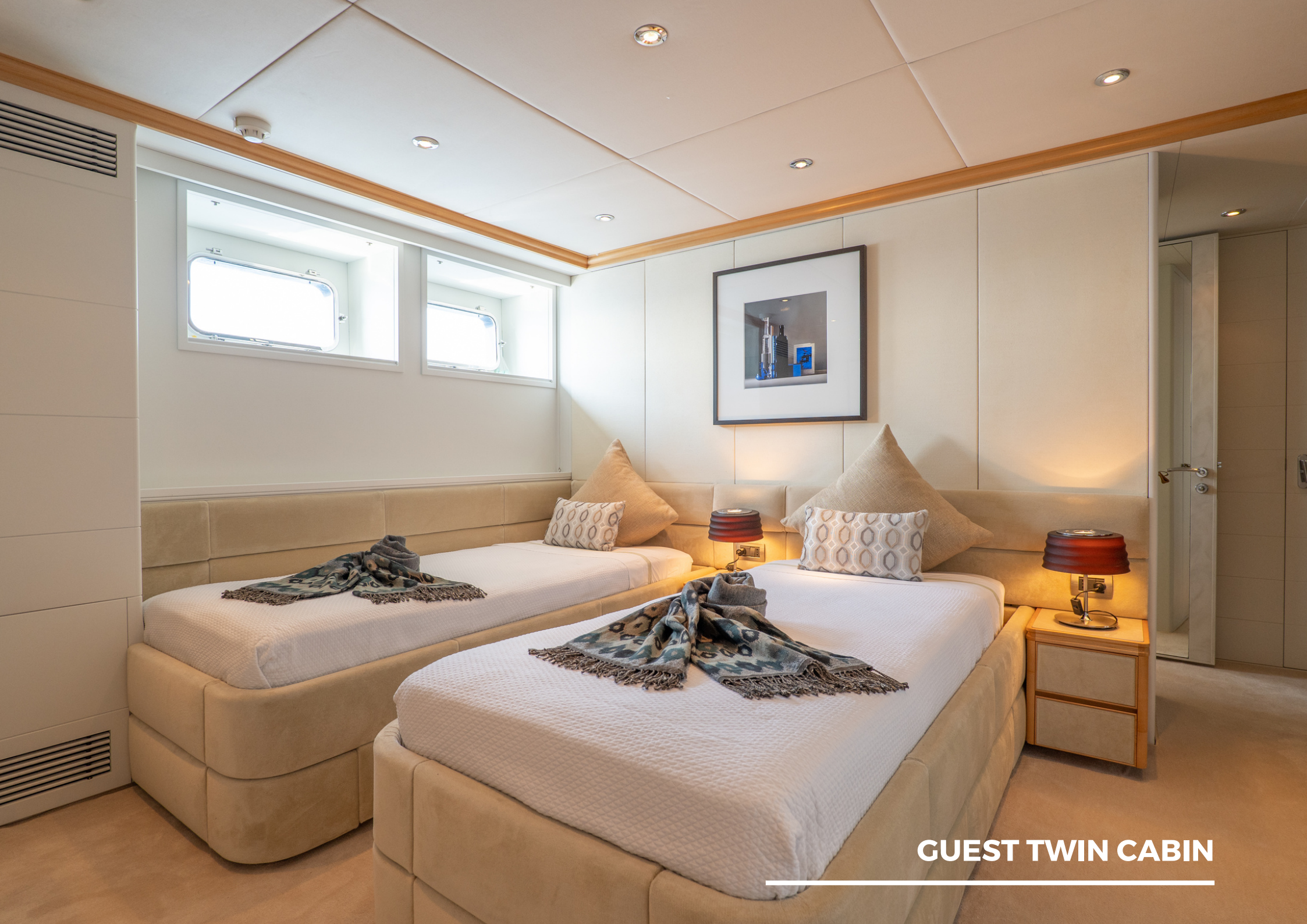
GUEST TWIN CABIN