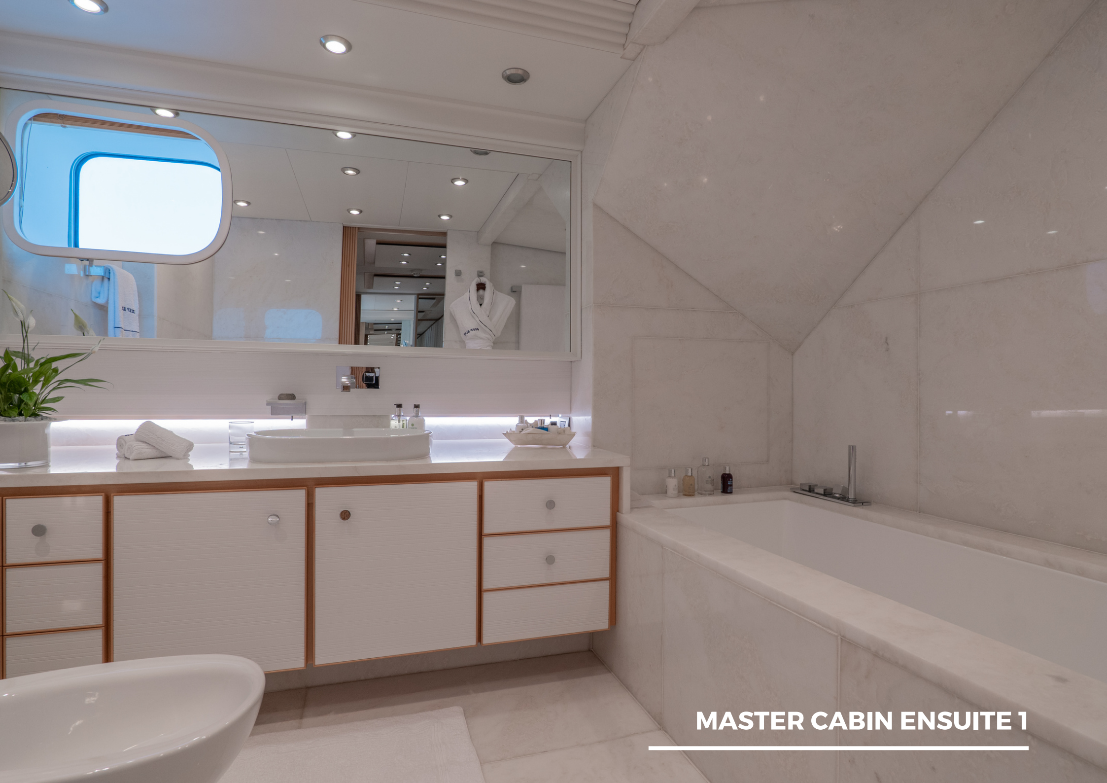
MASTER CABIN ENSUITE 1