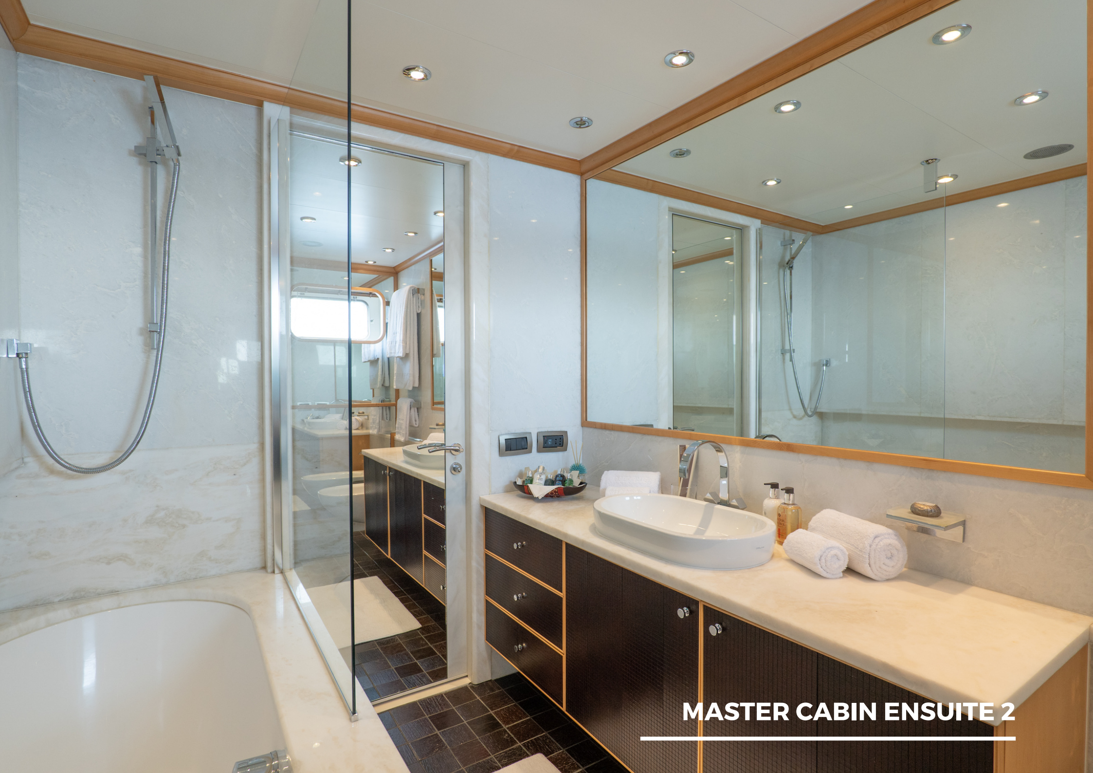
MASTER CABIN ENSUITE 2