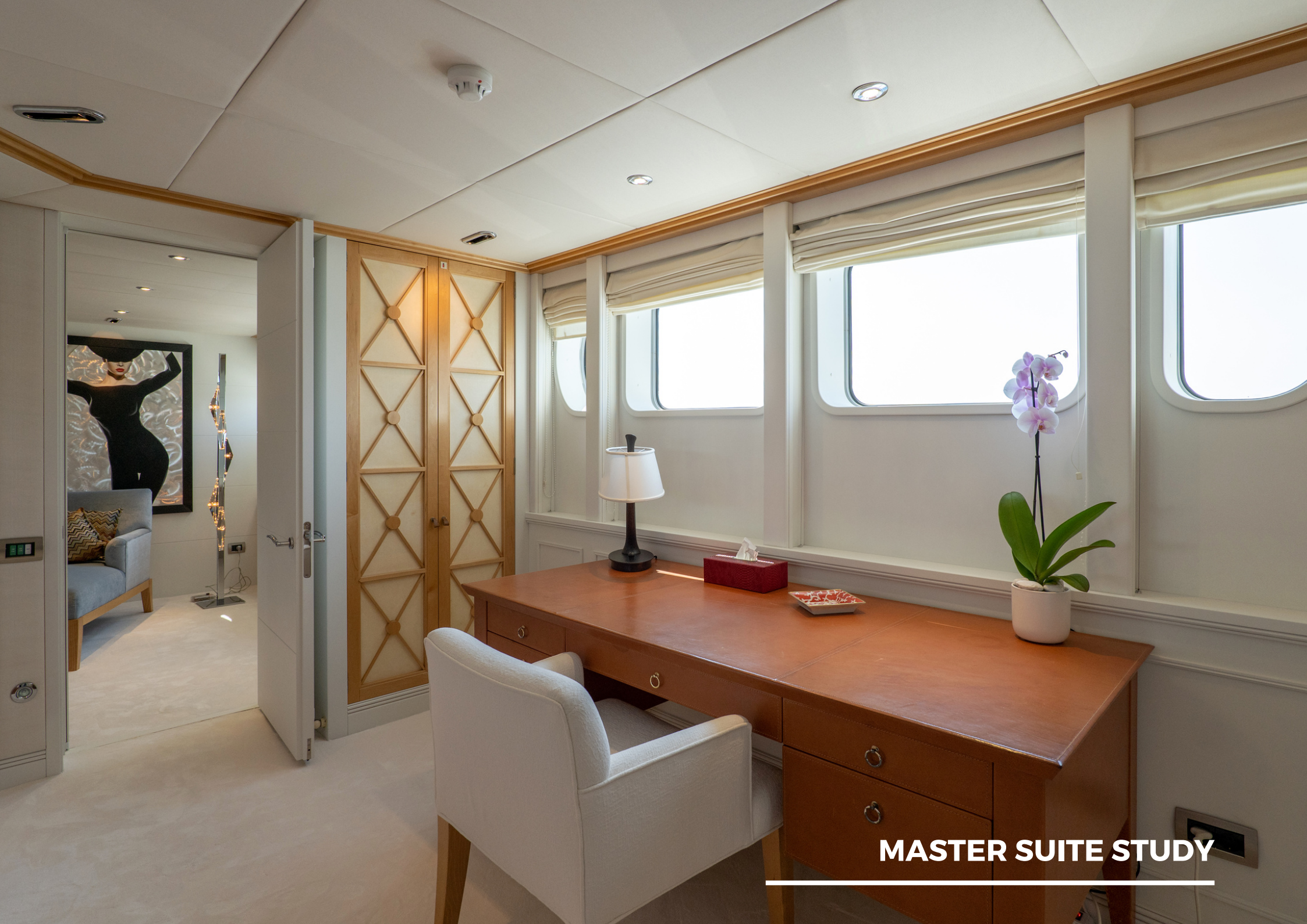
MASTER SUITE STUDY