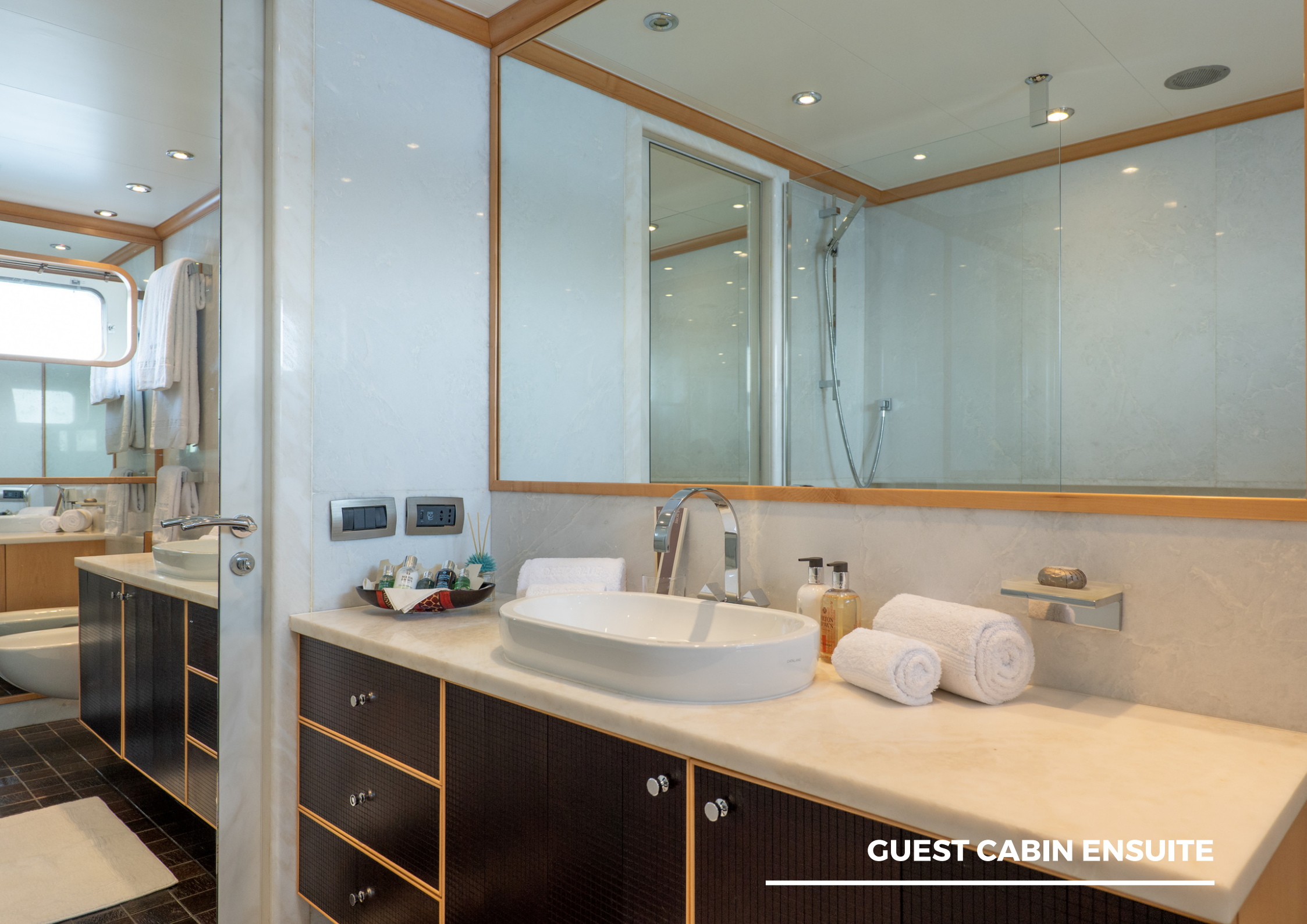
GUEST CABIN ENSUITE