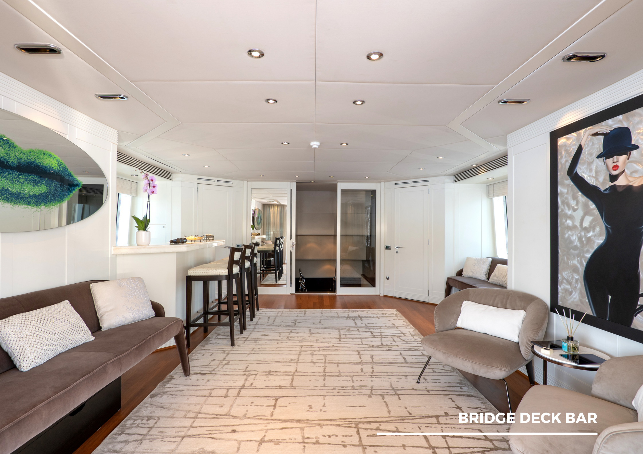
BRIDGE DECK BAR